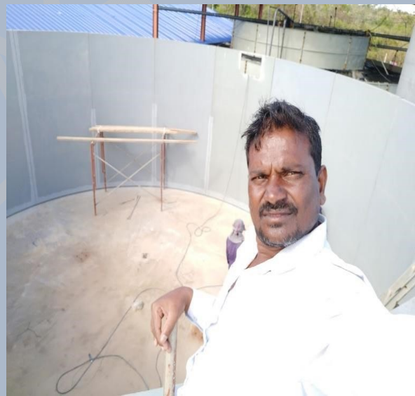
FRP TANK- BOTTOM CONCRETE SEA WATER STORAGE TANK 200KL SRI LANKA