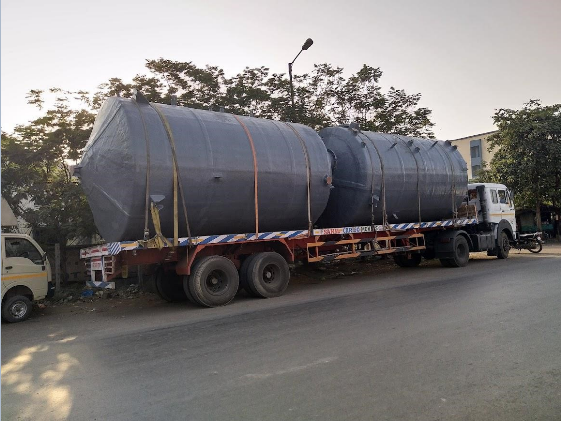
REACTOR 50KL FLAT TOP CONICAL BOTTOM RIGID STRUCTURE