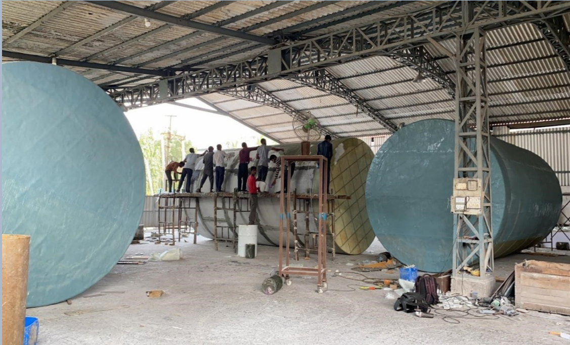
PP FRP TAPER BOTTOM SLOPE- 50 KL – FABRICATION IN PROGRESS