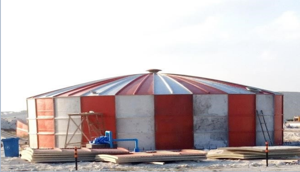
FRP TANK BOTTOM CONCRETE RCC 500KL MALDIVES AIRPORT