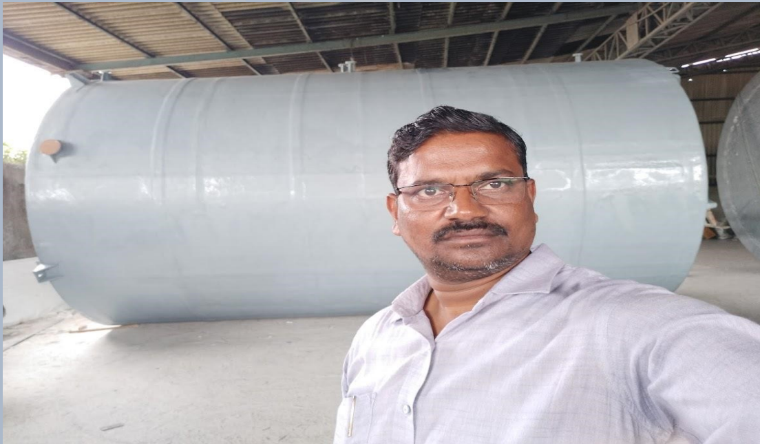
FRP STORAGE TANK 100KL -- FOR JAY CHEMICALS