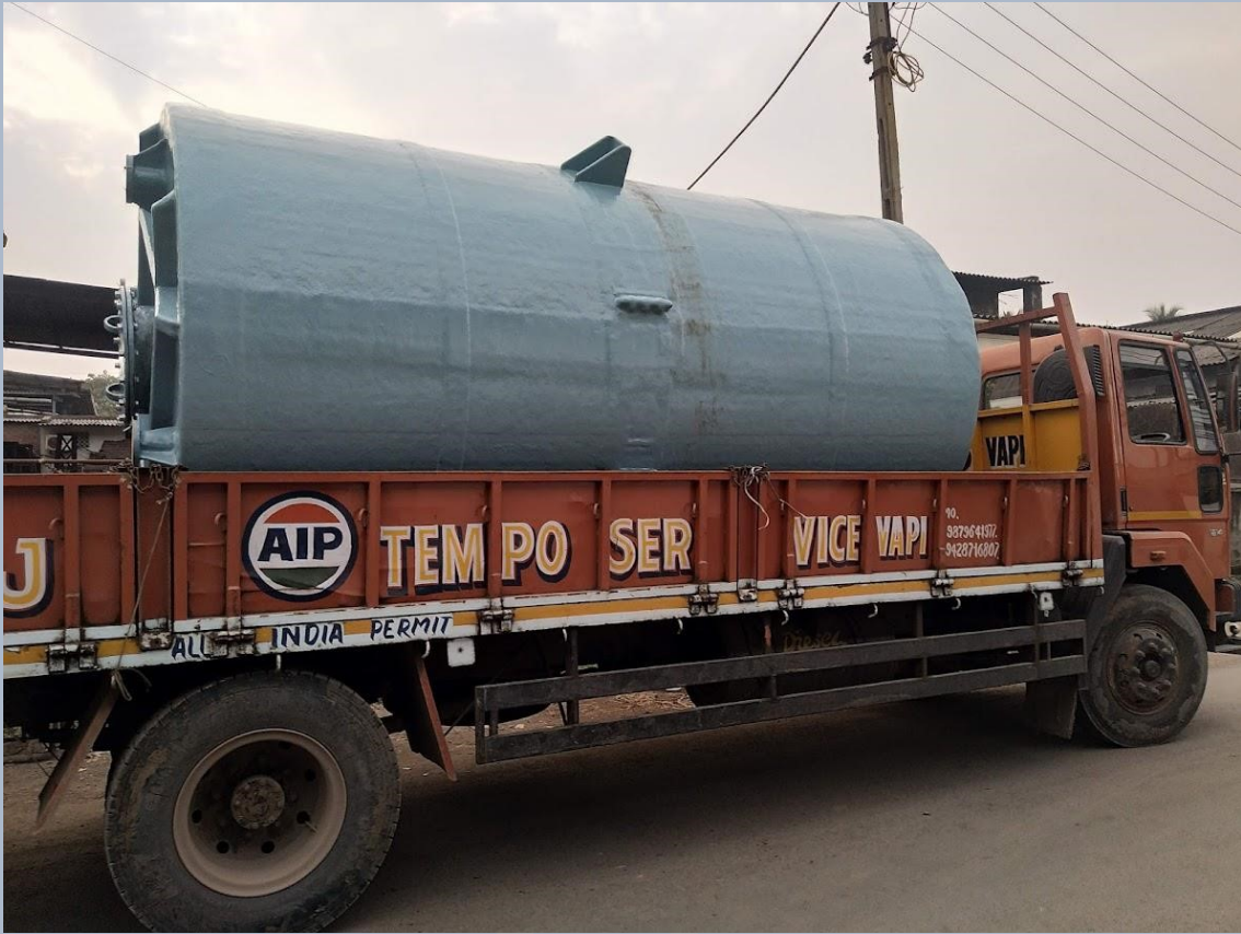
FRP SELF DEPENDANT VECTOR TANK - 25 KL FOR SPECTRUM CHEMICAL