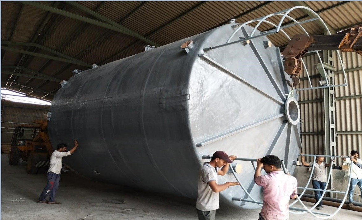
PP FRP STORAGE TANK 75 KL - FOR AARTI CHEMICALS