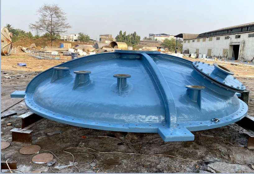
FRP - 3600 Ø FRP DISH COVER – JAY CHEMICALS