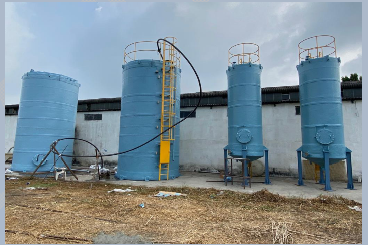
PP FRP STORAGE TANK WITH TAPER BOTTOM SLOPE- 50 KL- FOR FOSROC CHEMICAL LTD