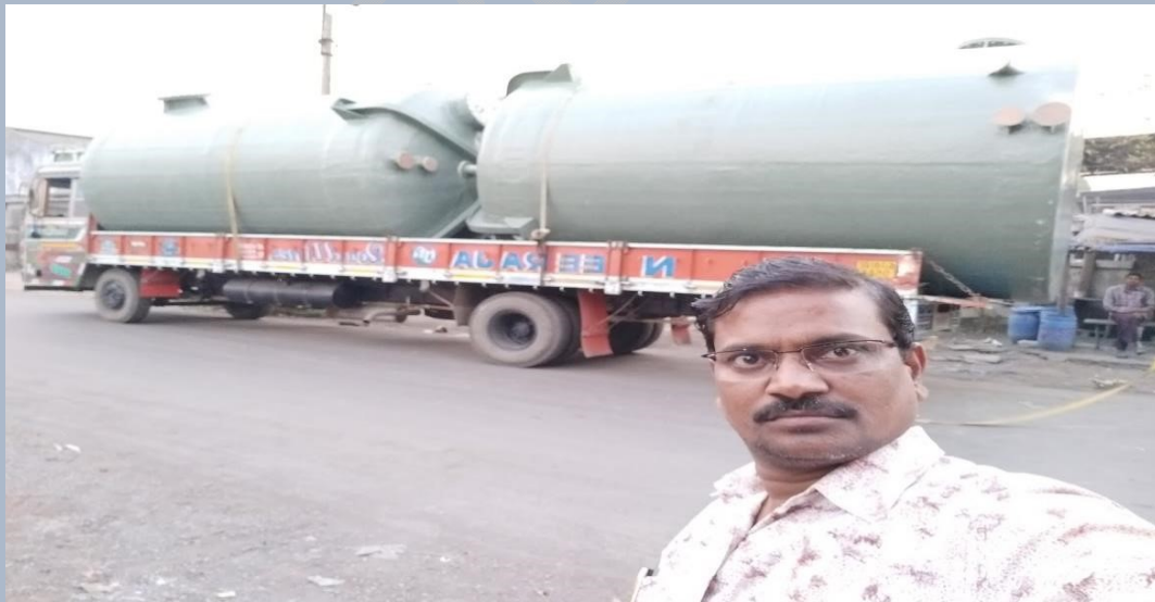
PARTY: FARMSON PHARMACEUTICAL