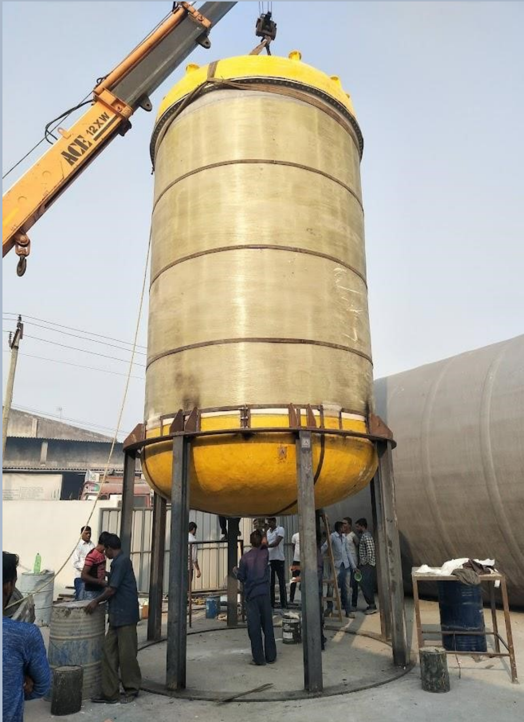
FRP VACUUM TANK WITH TOP BOTTOM DISH SELF RIGID STRUCTURE -- FOR SPECTRUM