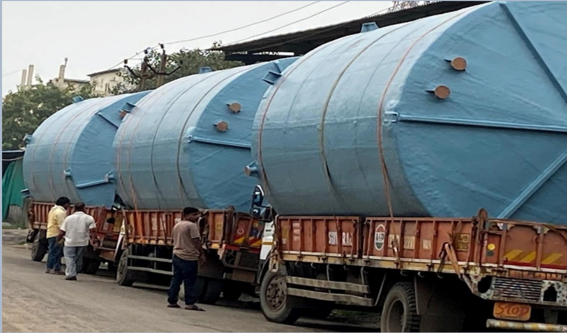
100 KL - TANKS DEPARTED TO FOSROC CHEMICAL LIMITED