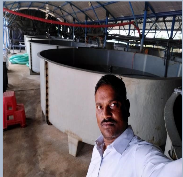
FRP FISH NURSERY TANK SRI LANKA