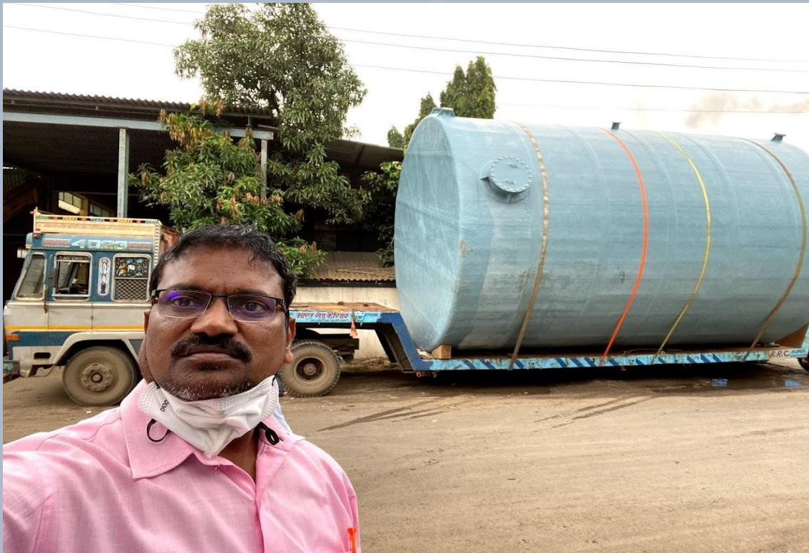
FRP TANK 200 KL JAY CHEMICAL