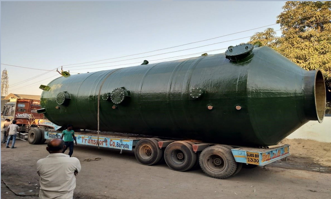
FRP REACTOR - 120 KL FOR MOJJ ENGINERRING SYSTEM LTD