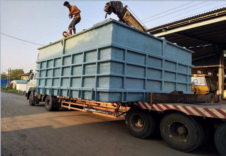
PP FRP CUBE RIGID TANK – 60 KL- FOR SYNGENTA