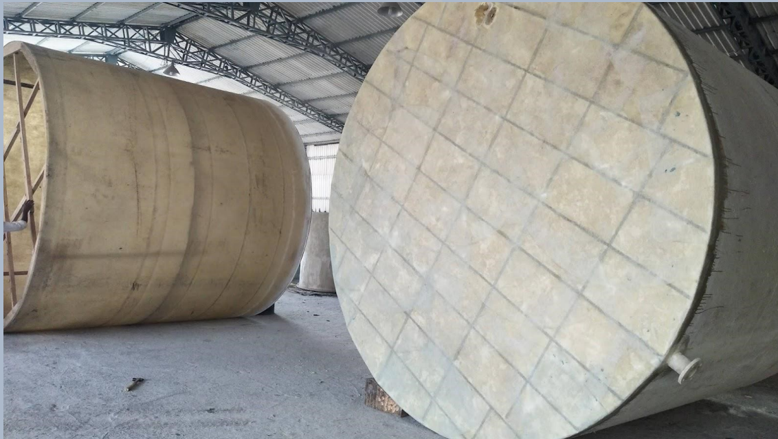
FRP TAPER BOTTOM SLOPE- 100 KL – FABRICATION IN PROGRESS - FOR SPECTRUM CHEMICALS