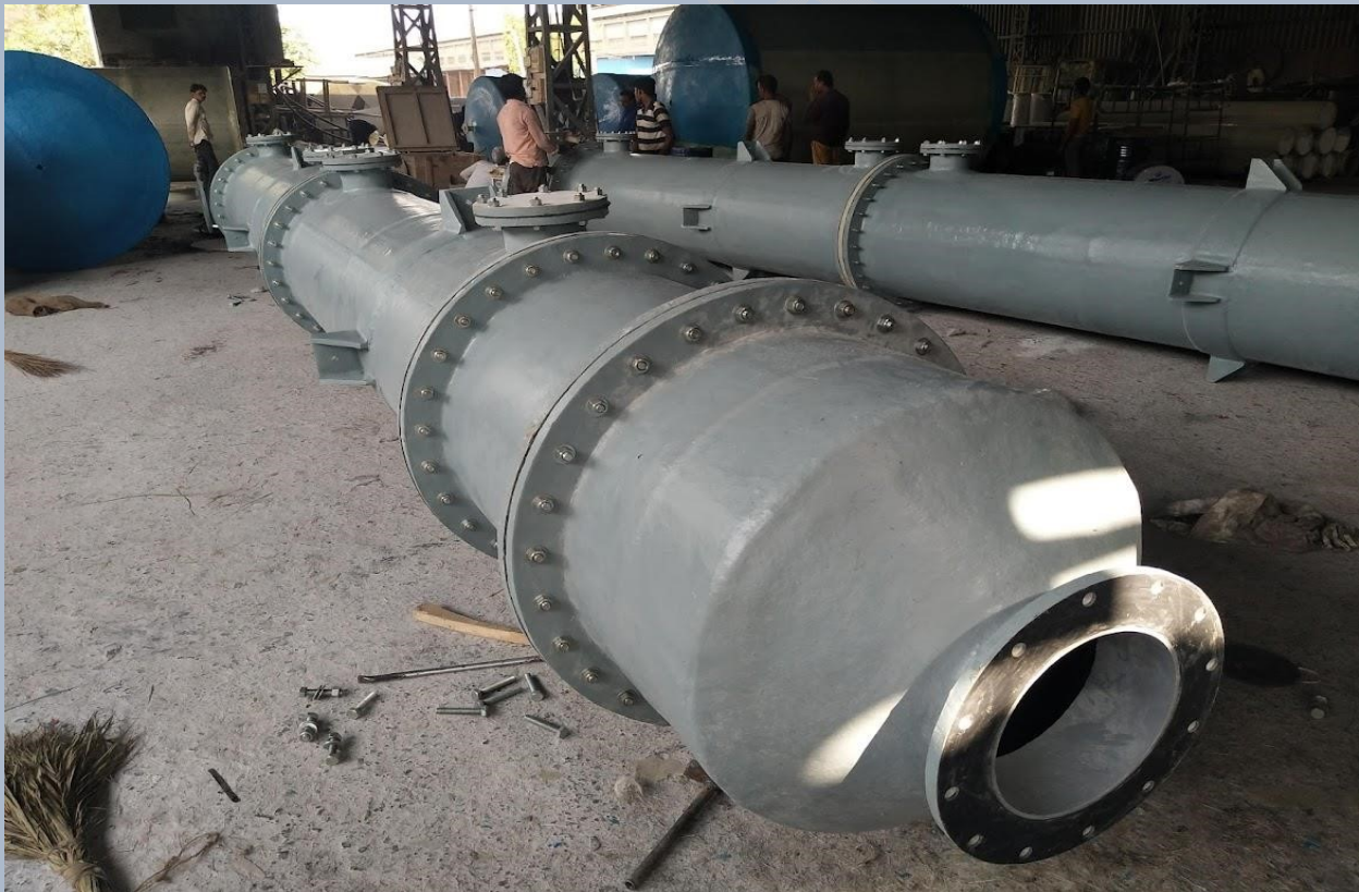
PP FRP SCRUBBER – FOR JAY CHEMICALS